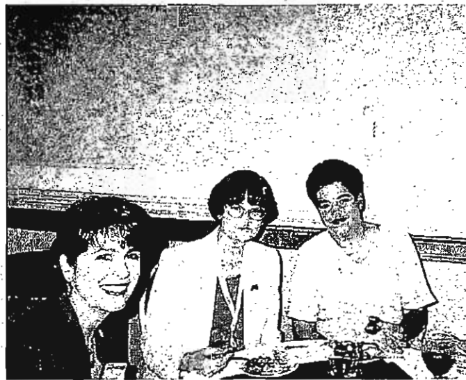
SEAALL's reception in Philadelphia