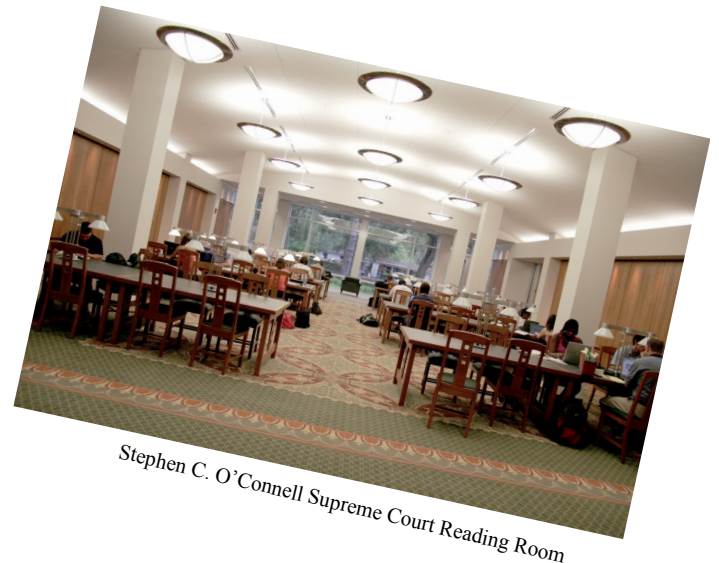
Stephen C. O'Connell Supreme Court Reading Room