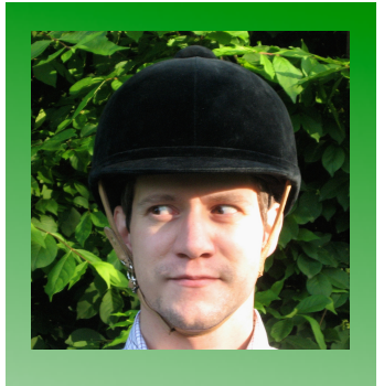
SEAALL Newsletter Editor

Packed with pages, this issue features many interesting, informative, and insightful contributions from our SEAALL membership. From a peek at a private bookshelf, a library profile, and SEAALLSucker social to book recommendations, recent acquisitions, and recipes, surprises and delights await. And what's that bit you say about the opportunity to win a prize? The first SEAALL member to send the SEAALL Newsletter Editor, via email, the correct answer to the Reference Desk Question will receive a lovely prize all the way from Lexington, Kentucky. What more could you ask for, honestly! Read on, dear reader, read on.